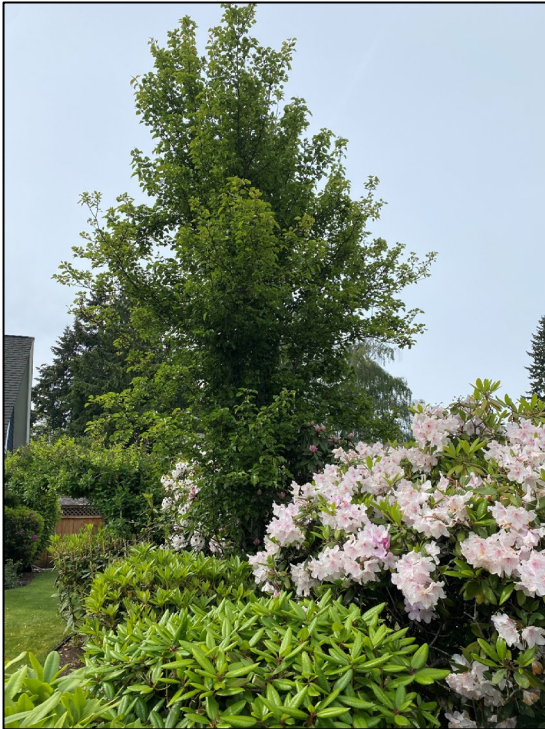
Photo # 1: Tree # 247 the Bradford Pear on the adjacent property to the east at 8945 SE 56 th Street.